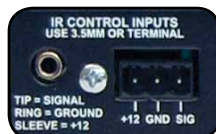
Standard 3.5mm IR jack or terminal connection.