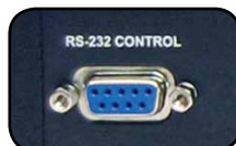
RS-232 for standard serial control.