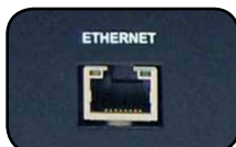
Ethernet control via PC or other IP control system.

Virtually any control system or programmable remote can take full advantage of audio switching, EQ settings, zone grouping, lockout and more. Basic functions of the ADX Series Audio Switchers can be controlled with IR via 3.5mm and terminal connectors or via the IR receiver on the front.