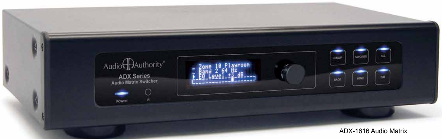
ADX-1616 Audio Matrix